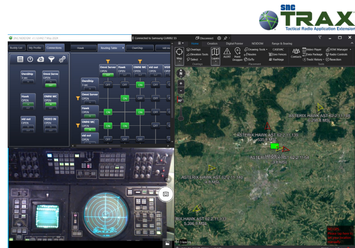
Digital Integration of Legacy Systems into SNC TRAX

High TRL (7-9), COTs hardware and software solutions