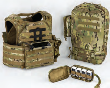
Line Medic Kit